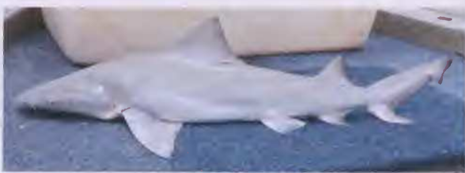
Figure 1. Northern River Shark ( Glyphis garricki ), South Alligator River, Northern Territory.

The river sharks (family Carcharhinidae; genus Glyphis ) are euryhaline sharks found in the tropical Eastern Indian-Western Pacific region. All five described species are threatened with extinction with restricted ranges and small population sizes, and their ecology is generally poorly-known. The Northern River Shark ( Glyphis garricki ) (Figure 1) is found in northern Australia with three known populations centres: (1) river drainages of the Van Diemen Gulf, Northern Territory; (2) King Sound, Western Australia; and (3) Joseph Bonaparte Gulf/Cambridge Gulf and associated rivers, Western Australia (Pillans et al. 2010). Additionally, the species has been recorded from southern Papua New Guinea (Compagno et al. 2008), but there is little information on its distribution and occurrence there.